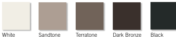
White Sandtone Terratone Dark Bronze Black