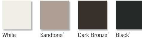
White Sandtone * Dark Bronze * Black *