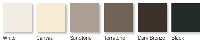
White Canvas Sandtone Terratone Dark Bronze Black